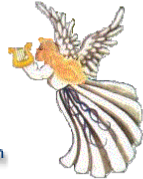
Our Lord and Savior Jesus Christ Was Born